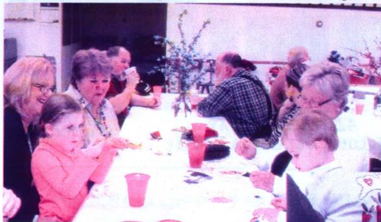
Community families gather for old fashioned Sunday Dinner

$1,000 was raised during the fifth annual McCloud Masonic Lodge fundraiser on March 27 and $1,000 donated as matching by McCloud Masonic Lodge #126. Thanks to all who brought food, helped with serving and attended! Masonic Lodge #126, you're the greatest!